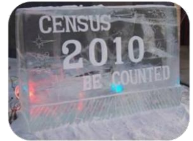
Ice Sculpture at FNB of AK

The Business Subcommittee Partners wrote Census grants in hopes that we might be able to spread Census 2010 awareness while sharing products with the community. All grant applications were approved!