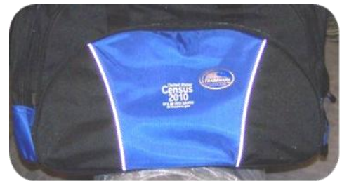
Interior AK Center for Non-Violent Living duffel bag

It will not be an easy task to reach this group but we are convinced that our efforts will be rewarded with the most accurate count yet.