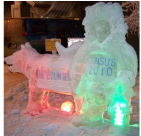
Ice Sculpture at Springhill Suites Marriott

The Government Subcommittee has a large presence among the Census Grant applicants. The thoughtful use of the funds gives us great pride as good stewards. It is certain the Job Fair will have a high profile and the Homeless Connect efforts will be rewarded with an accurate count!