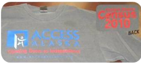
Access Alaska shirt design

community members and provides information and referral to over 1,500 individuals and groups as well as maintains a presence in Tok and Nenana. Access Alaska used Census grants to purchase T-shirts promoting the Census 2010 for distribution.