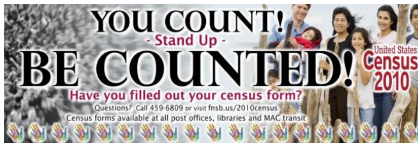
Sign for Outside of Buses

Media has also created Twitter and Face Book accounts, and a website to spread the word about the 2010 Census.