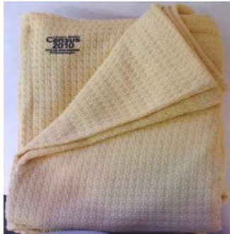
Blankets for Homeless